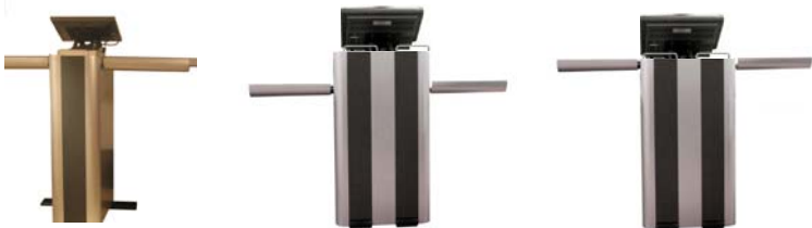
ILS16 & ILS24 Tablets adjustment convenience