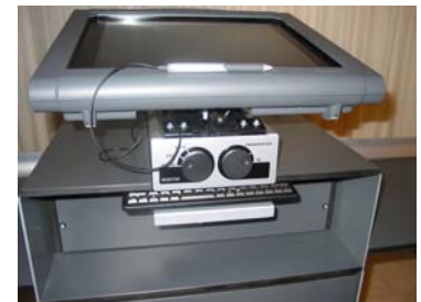
Dual switching for continuous display

Same power, more flexibility, more space... full 19" square rack inside. Insert a powerhouse for streaming presentations, control audio and camera. All the tools integrate into one beautiful podium to broadcast your subject or for teamwork play..